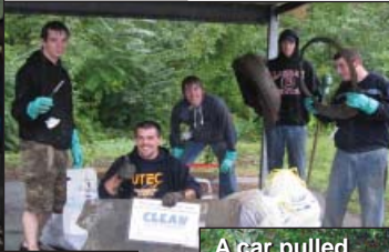
A car pulled from Swan Creek