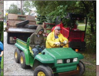
Sunoco at Oregon Kickoff