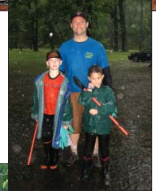
Wet fun at the Picnic