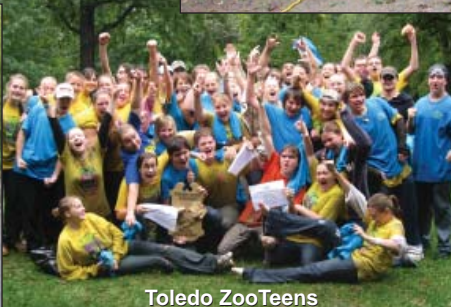
Cleaning up Wood County